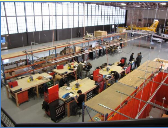
Moody's new maintenance training facility in the historic Air National Guard Hangar