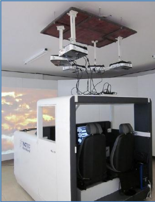
Handmade flight simulator for the MAF flight school in Southeast Asia